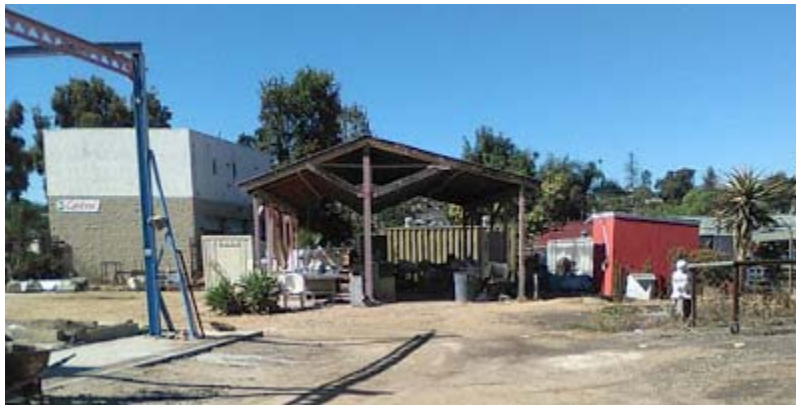
The wood and stone sculpture labs