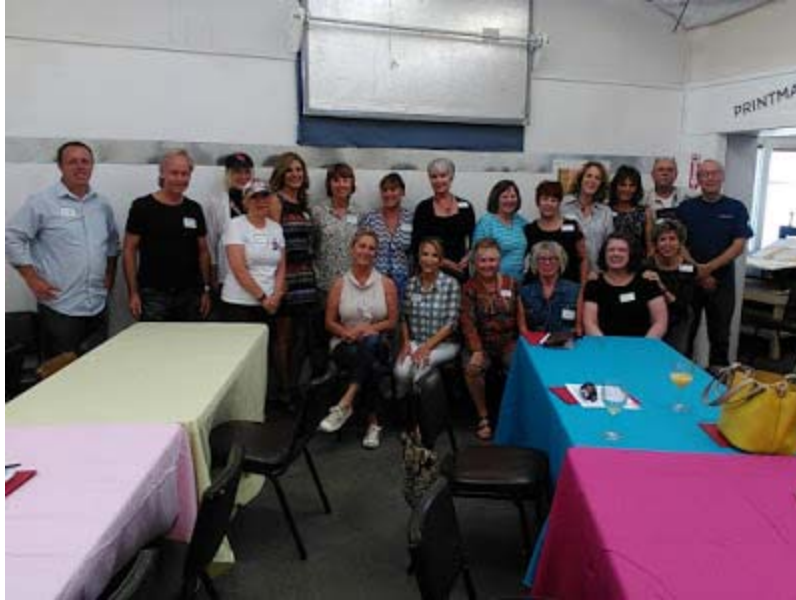
A photo op for all those that attended the special breakfast for NCAN members

www.SDVisualArts.net 760.943.0148 info@SDVisualArts.net 2487 Montgomery Avenue, Cardiff by the Sea, CA 92007 Public Charity 501 (c) 3 EIN #20-5910283