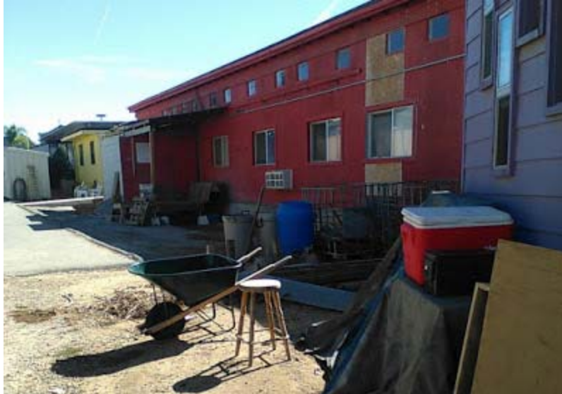
A back view of three of the buildings

www.SDVisualArts.net 760.943.0148 info@SDVisualArts.net 2487 Montgomery Avenue, Cardiff by the Sea, CA 92007 Public Charity 501 (c) 3 EIN #20-5910283